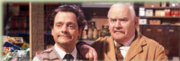
Arkwright & Granville Could Langley Mill be the inspiration for 'Open All Hours'?