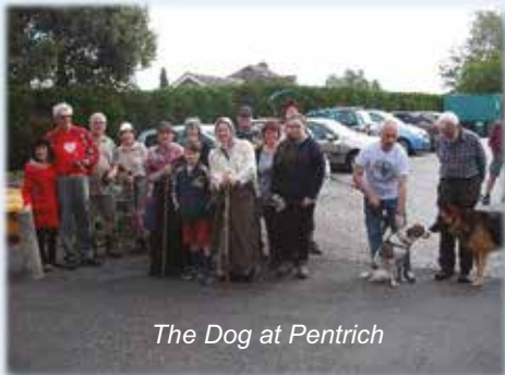
The Dog at Pentrich