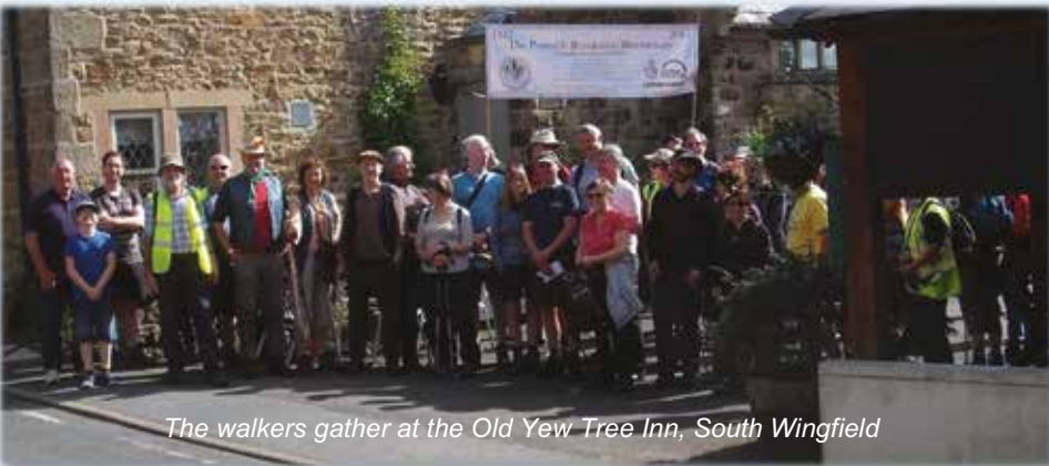
The walkers gather at the Old Yew Tree Inn, South Wingfield