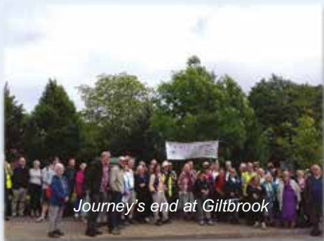
Journey's end at Giltbrook