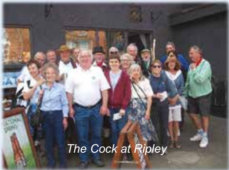
The Cock at Ripley