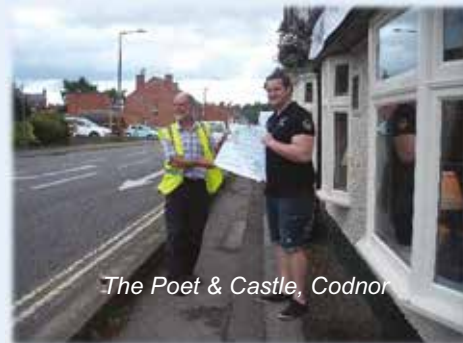
The Poet & Castle, Codnor