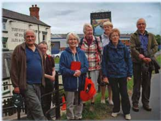
Walkers at the Great Northern, Langley Mill

Two hundred years ago, on the night of the 9 th /10 th June 1817, a band of men, probably around 200 or so, and lightly armed with pikes, scythes and a few guns turned up at the Navigation Inn at Langley Mill. They were on a march to Nottingham, intent on over-throwing the Government of the day.